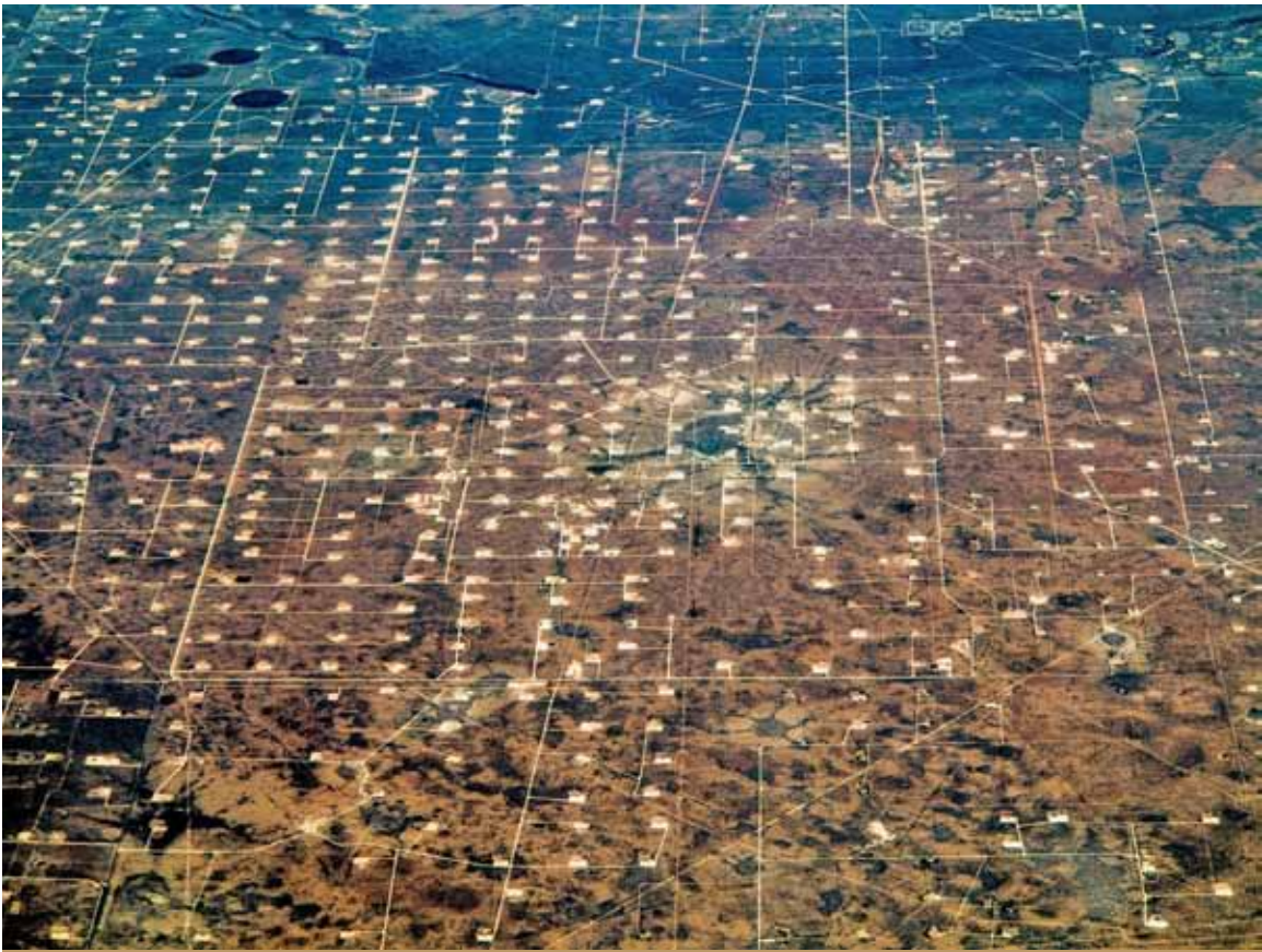
A grid of drilling sites and roads, similar to those used in fracking, lies across the landscape near Odessa, Texas.

In the years to come, fracking may affect a much bigger share of the landscape. According to a recent analysis by the Natural Resources Defense Council, 70 of the nation's largest oil and gas companies have leases to 141 million acres of land, bigger than the combined areas of California and Florida. 113 More-