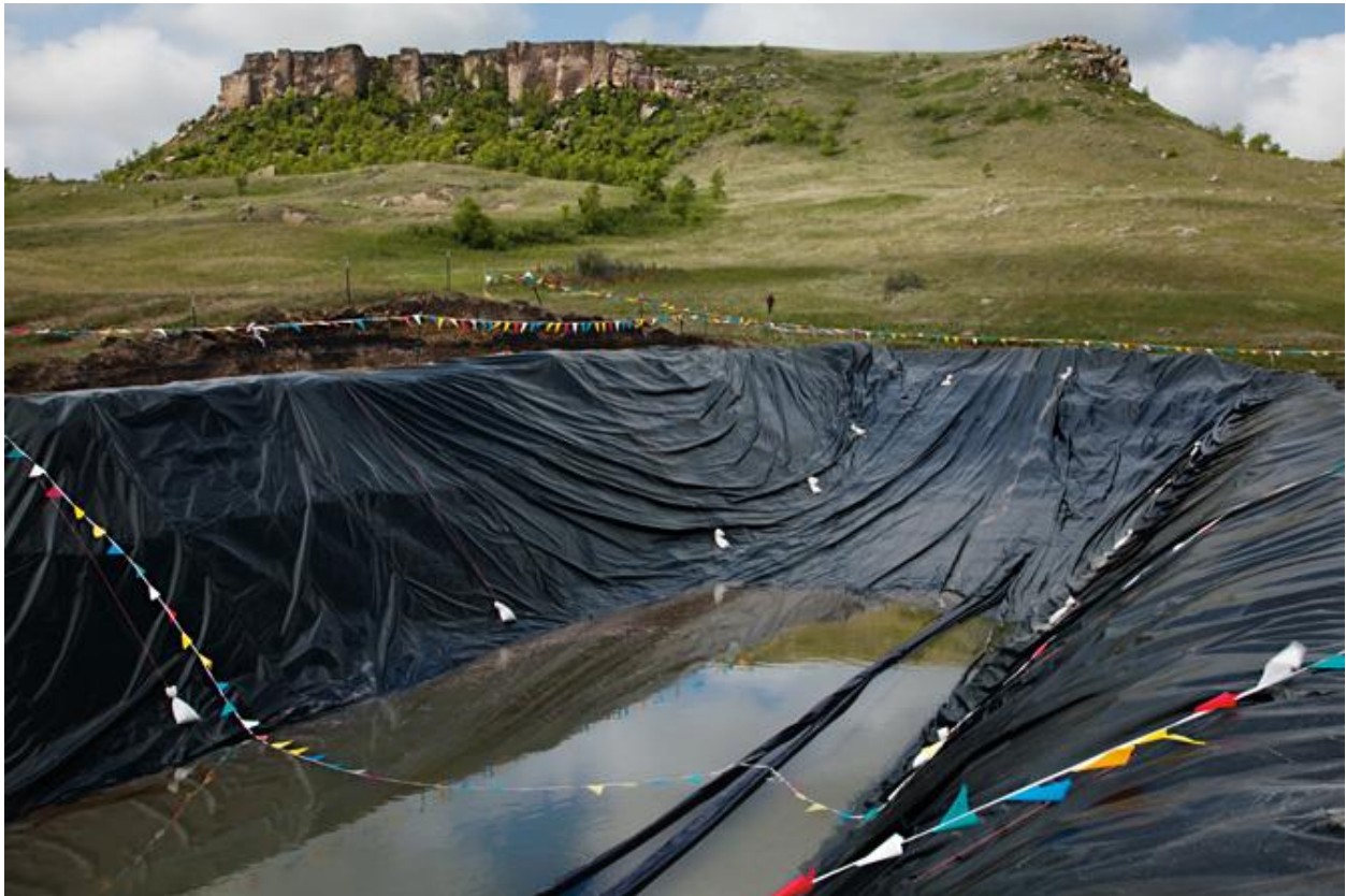
A lined pit containing rainwater and borehole waste lies at the foot of Thunder Butte, sacred to area tribes. According to legend, the butte is the source of the world's rain. Fracking requires large amounts of fresh water; in this drought-prone region, drawdown and contamination of aquifers worry many.