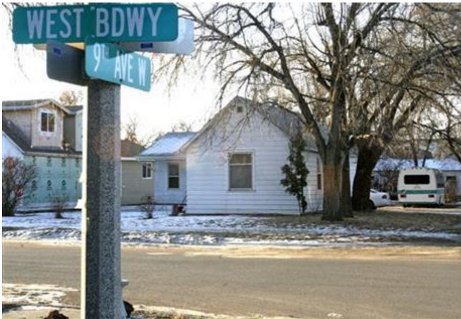
A trailer sits in the backyard of a home in Williston, N.D., on Friday, Feb. 28, 2014. Federal prosecutors say the area outside the home, including this intersection and trailers in the backyard, was the site of an August 2012 drug-related assault planned by a ring known as "The Family." During the incident, prosecutors say group members beat another member of the group they thought might become a police informant. He was left for dead in a Montana field, but wound up in a North Dakota hospital, telling the FBI his story.