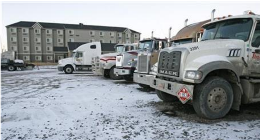
Trucks sit in a parking lot outside one of many newer multi-story hotels in Williston, N.D. on Tuesday, Feb. 25, 2014. Williston is the hub for the Bakken shale fields oil boom in North Dakota. Because of a housing shortage, the hotels often serve as temporary housing for oil workers. Big money is raining down in small towns. But the bonanza suddenly flourishing here has also brought with it a dark side: a growing trade in meth, heroin, cocaine and marijuana, drug cartels and newfound violence.