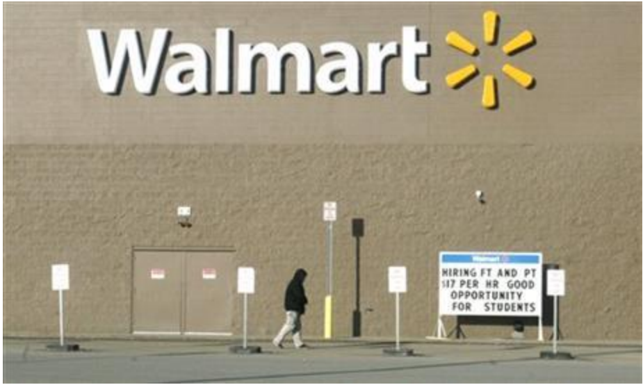
A shopper walks next to a Walmart store on Friday, Feb. 28, 2014 in Williston, N.D. near a sign advertising a $17 hourly wage for new employees - a rate higher than in many cities. The Bakken shale fields oil boom has brought about a high cost of living in the area, especially for housing.