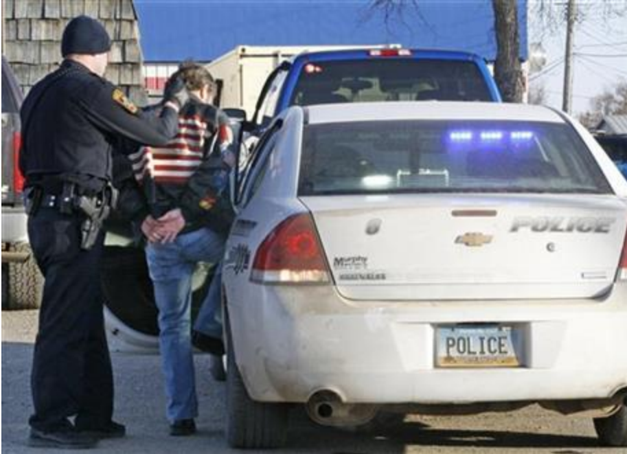
An officer guides a handcuffed man into a police car in Williston, N.D. on Friday, Feb. 28, 2014. Officials at local law enforcement agencies throughout the region say a marked increase in population from the oil boom is stretching their resources. They also say crime, including drug trafficking, is up.